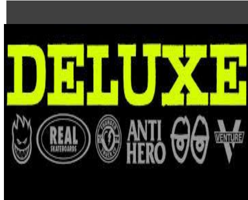
Above is the Deluxe Distributing company logo along with some of the brands they represent.

Founded in 1986 and originally intended to be a record label, Deluxe Distributing has come a long way over the past few decades. Deluxe Distributing is a company that makes quality skateboards and skate parts and ships them worldwide. The companies represented by Deluxe are Spitfire, Real Skateboards, Thunder, Antihero, Krooked, and Venture. All of these are names known throughout the skate community. These companies are all in a big industry in San Francisco called Deluxe. All these companies make a portion of the skateboard with companies like Real, Krooked, and Antihero providing decks, while Spitfire turns out wheels and Venture and Thunder covering trucks. They ship these parts to China, Mexico, etc. Deluxe is successful because there are so many skaters in the greater San Francisco area. With dozens of skate parks in San Francisco, most of which are close to the skate shop, there is a steady flow of customers for Deluxe.