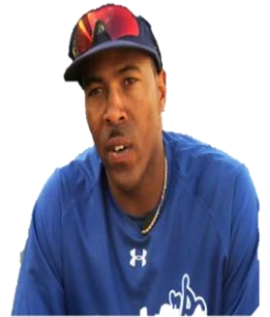
J WASH 1B COACH (PADRES)