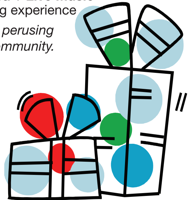
FIG GARDEN SWIM & RACQUET CLUB 4722 N. Maroa Ave Fresno

Community children who participate on the Team will benefit with further coaching/training in swimming and triathlon skills.